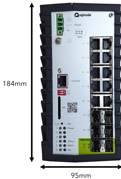
iGigaSwitch 1606 HSR SFP-6VI AC HW5 88306476